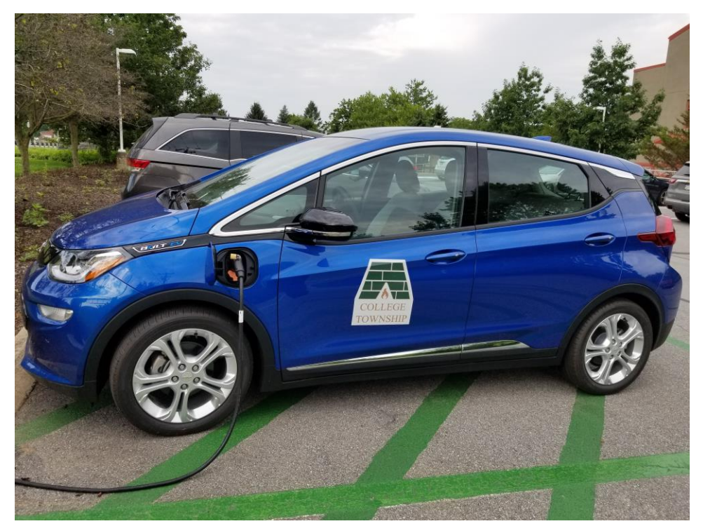
College Township, Centre County AFIG-funded EV

Maximum Grant Award: $300,000 Applications due December 15<sup>th</sup>