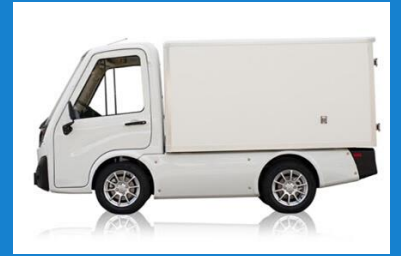
ABLE Cargo *