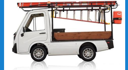
ABLE Trades *