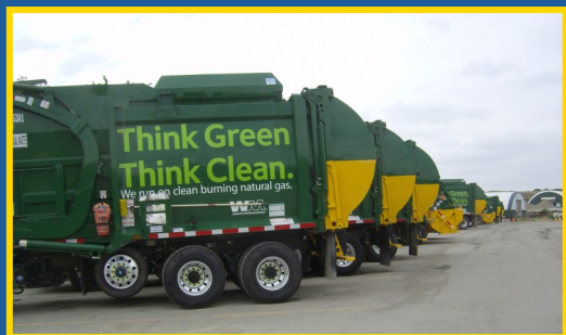
Waste Management Trucks Refueling

Does my emergency response plan include ethanol? Am I confident in my knowledge concerning ethanol safety standards? Can I treat ethanol like regular gasoline? What should I do in an ethanol emergency? Do I have the right type of fire extinguisher for an ethanol fire? Am I familiar with my emergency equipment? Is ethanol safe? Am I prepared with clearly posted emergency numbers? Do I know what needs to be included in an emergency plan? Why is ethanol safety important? Who can answer my questions about ethanol safety? Where is the emergency shut-down button located?