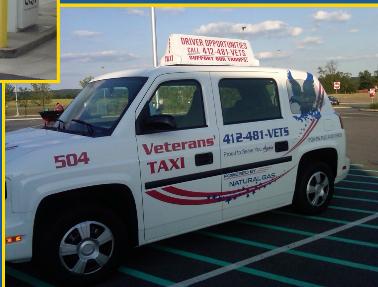
Veterans Taxi at Turnpike Service Plaza in Fuel Efficient Vehicle Parking