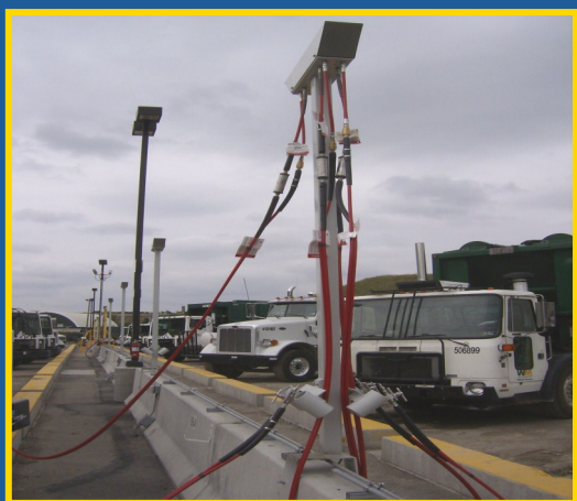
Fueling Posts at Waste Management