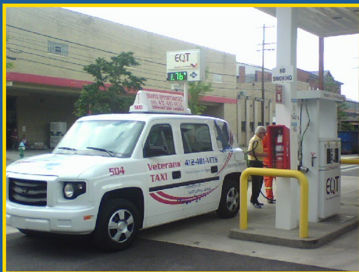
Filling up at EQT station for trip to Philadelphia