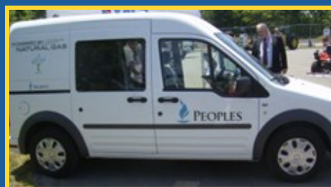
People Natural Gas Bi-fuel Ford Transit