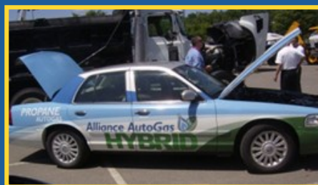
FYDA Bi-Fuel Vehicle