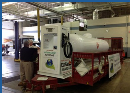
ProGas Propane Flat Bed Model