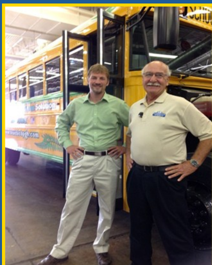
Blue Bird Auto representatives stand in front of their 72 passenger propane school bus.

Cellones Bread, FYDA Freightliner, ProGas and Veterans Taxi. Along with education on propane conversions, guests were able to watch a propane school bus fuel demonstration. Other model vehicles included propane taxis, a propane bread truck, propane flat beds and a propane van. The event was another successful, hands-on learning session for PRCC and propane development.