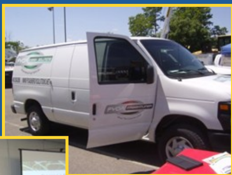
FYDA Bi-Fuel Vehicle