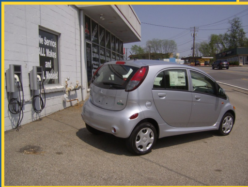
Miev with two wall mounted charging stations